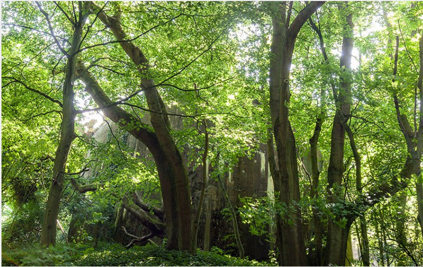
Bois d'Haringzelles (Eden 62)