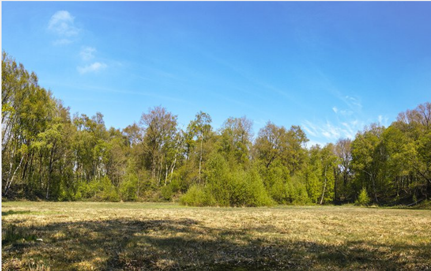
Bois des Bruyères (Eden 62)