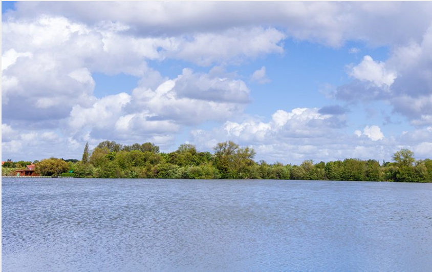
Lac d'Ardres (Eden 62)